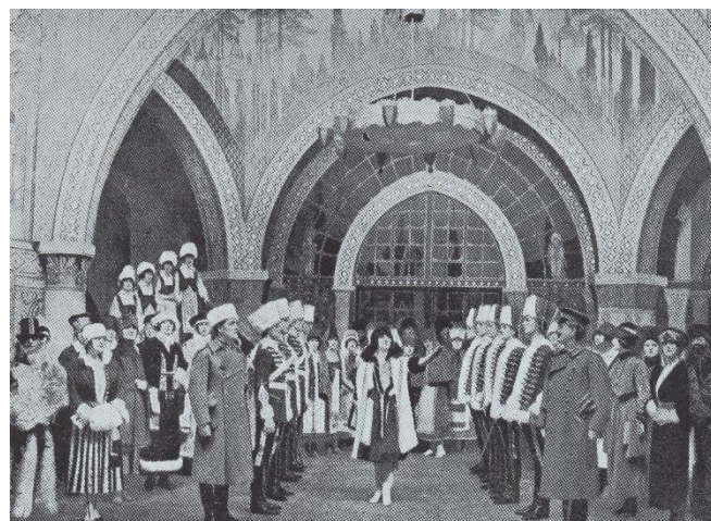
Scene 1 in the entrance hall to the Grand Hotel, taken from the 48-page programme produced to accompany the show (below).

error she plays along with in order to prevent Lieutenant Petrov being punished as a deserter. The Grand Duke (Eric B. Broster) arrives and plays along with the conceit, but when the Grand Duchess (Edith Clarke) finds out what is happening she is less than impressed.