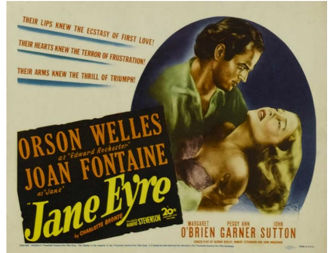
Movie poster for the 1943 version of 'Jane Eyre', adapted by Aldous Huxley, Robert Stevenson and John Houseman.

Williamson Players. The film adaptation of the novel, starring Joan Fontaine and Orson Welles, had been released in the UK in December 1943.