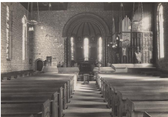
Interior of the church, 1950s.

The Earl of Burlington gave the site for the church and churchyard and the foundation stone was laid by the Rector of Keighley on Monday 2nd August 1841. At the time, Ingrow was quite a small hamlet of houses, farms and a few small mills spinning yarn or making paper. It came under the jurisdiction of Bingley rather than Keighley, which remained the case until 1894.