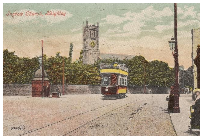
Electric tram pulls up outside the church in this 1905 postcard from J. Valentine & Sons Ltd.