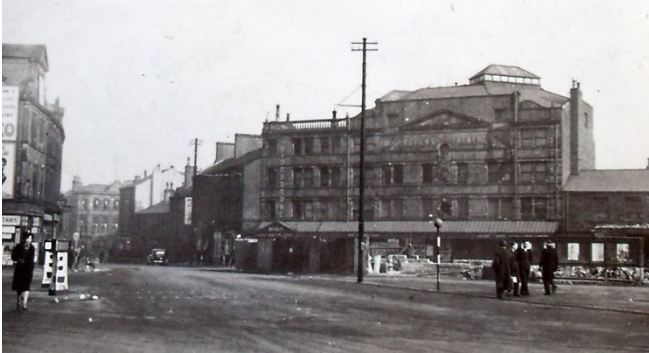
The Hippodrome and Queen's Theatre circa 1940. The site is now the location of the Airedale Centre multi-storey car park.

Tim Neal researches a 1949 stage production of Charlotte Brontë's classic novel 'Jane Eyre'.