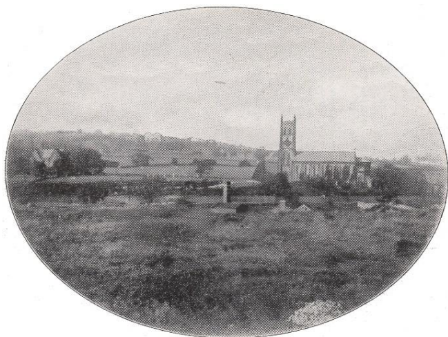
An early photograph of Ingrow Church, from the Church's own archive.

The Church of St. John the Evangelist in Ingrow celebrates its 180 th anniversary in March 2023. The church was consecrated by the Lord Bishop of Ripon on 14th March 1843, and Queen Victoria signed the order that created the parish for the church (the parish of Ingrow cum Hainworth) in May 1844.