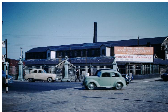
British Railway Goods and Coal Depot, at the junction of Cavendish Street with Bradford Road and East Parade, circa 1950. The site has been the car park for the Sainsbury's supermarket since the mid-1980s.

Keighley is my home. I was born in my maternal grandparents' house at 277 Bradford Road in Stockbridge, and when my father returned from service in the Second World War, my family lived for 6 years in a former MoD flat in Cavendish Street, overlooking the former Midland Railway Goods Yard. For a child, that was like having a gigantic train set in front of the bedroom window, with constant day and night shunting by steam tank engines, working LMS horses from the Lawkholme Lane stables and even cattle being driven on the hoof from pens in the Goods Yard to the Corporation Abattoir at Hard Ings.